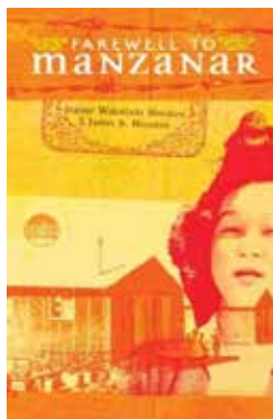
Farewell to Manzanar by Jeanne Wakatsuki Houston

A bold and bittersweet story of secrets and sacrifice, love and betrayal, prejudice and passion, China Dolls reveals a rich portrait of female friendship, as three young women navigate the "Chop Suey Circuit"--America's extravagant, all-Asian revues of the 1930s and '40s--and endure the attack on Pearl Harbor and the shadow of World War II".