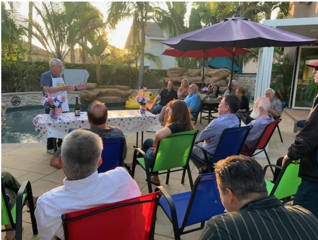
Four Seasons Book Group