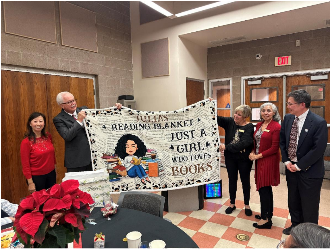
FOL-sponsored programs this month at the Library