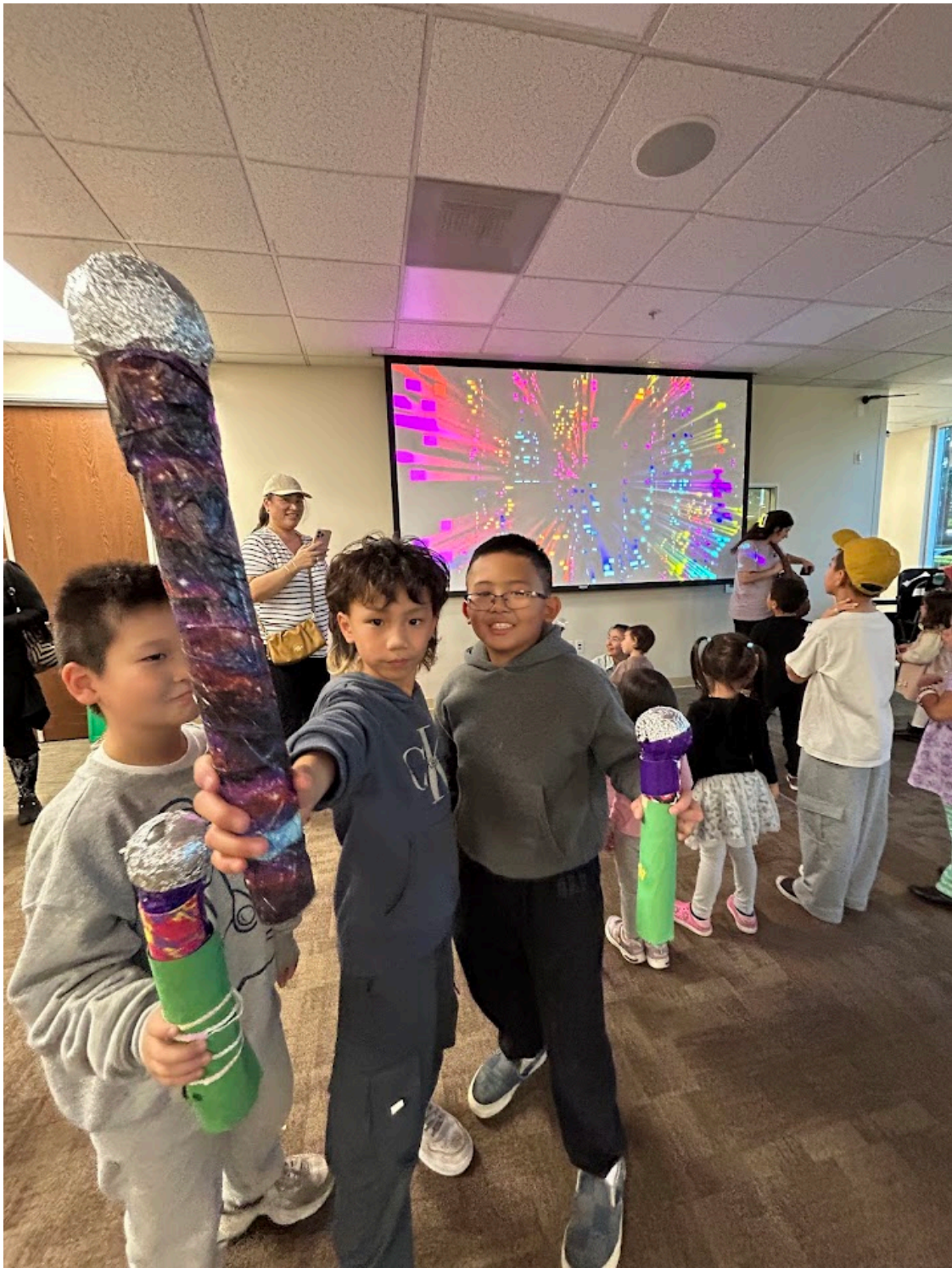
The Dinosaur who cried "Asteroid"