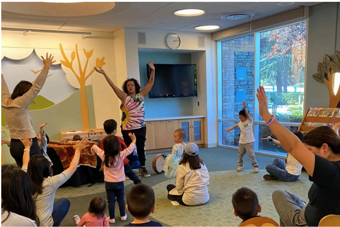
K-Pop Dance & Craft Party: It was really hopping! Over 100 attendees sang and danced to the best music!